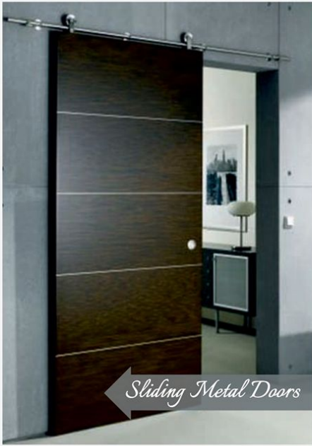
Sliding Metal Doors